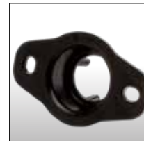
33805 Plastic Flange