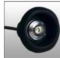
33705 Rubber Grommet